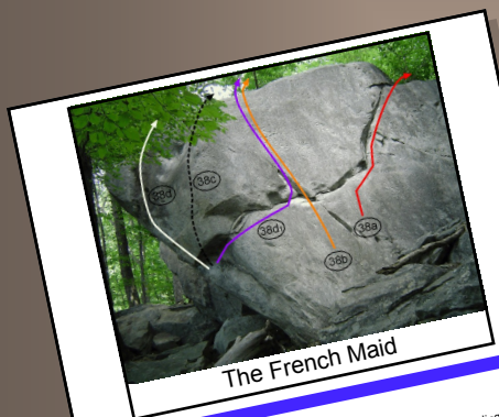
The French Maid