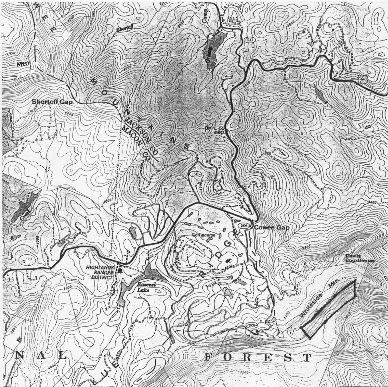
Highlands Quad Map

Whiteside Mountain Cliff, portion used for rock climbing and hang gliding, which extends along the uppermost face of the rock below the loop trail to the first continuous tree line below, from the orange painted boundary at the old parking lot at the easternmost point on the loop hiking trail to the orange painted boundary at the western end of the loop hiking trail. This described area is further delineated on the above map. Entry into or upon the area delineated is prohibited as specified in the closure notice.