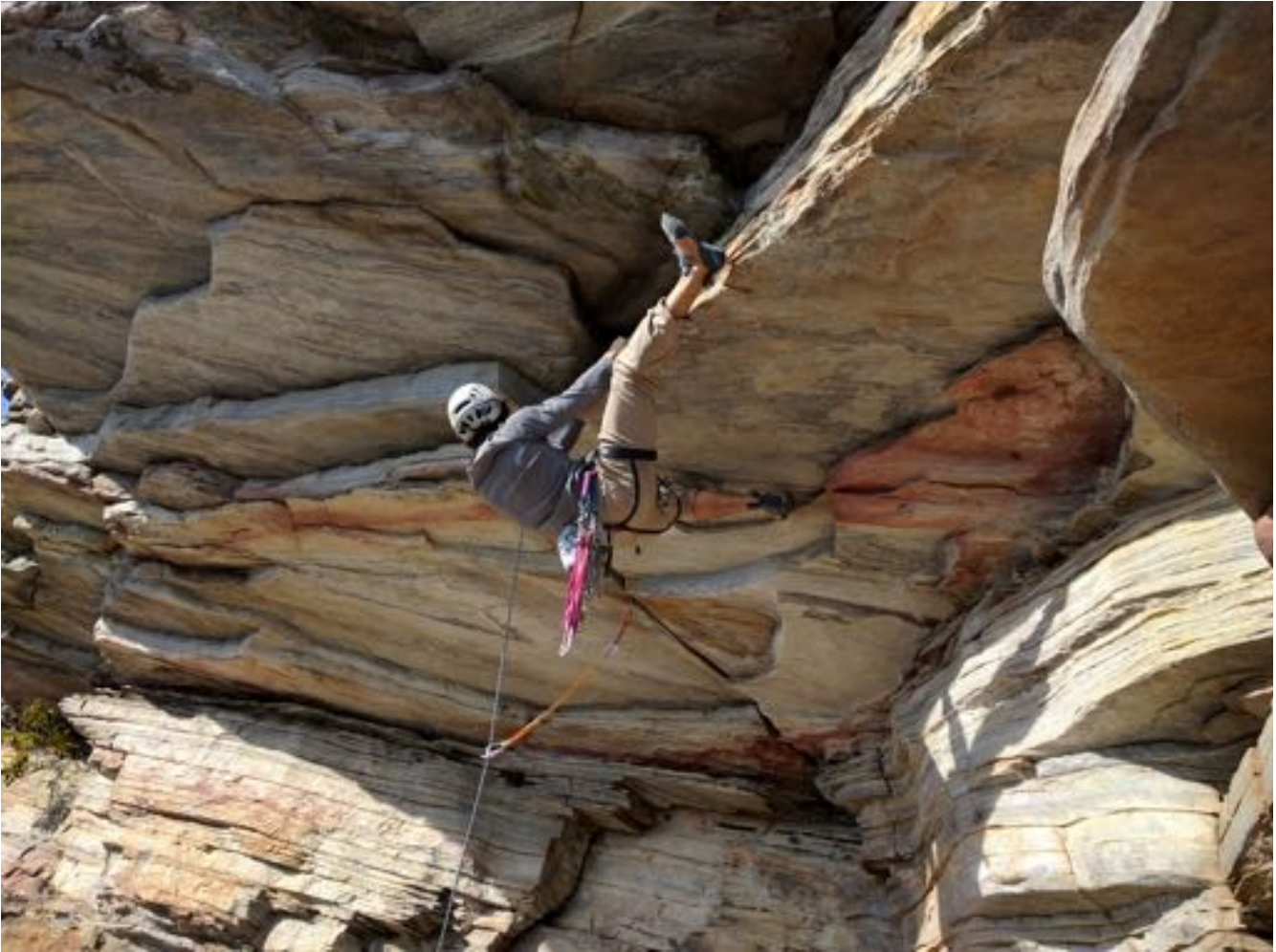
Illustration 4: Tim Reddy on Barbs World Extension.